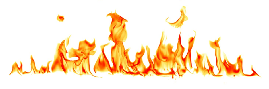
Mon, 7 - Sun, 13 April 2025