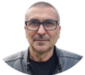
Marian Pintilie Romanian Fellowship